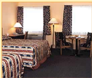
Days Inn - Kelowna