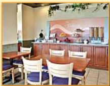
Days Inn Hotel - Richmond / Vancouver