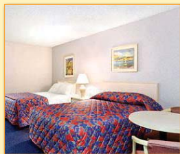
Red Roof Inn - Seattle Airport