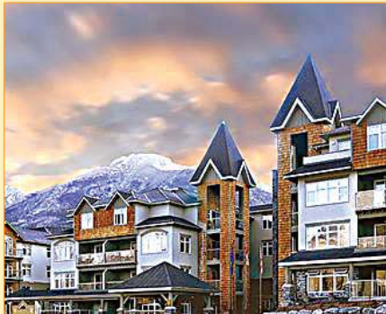
The Windtower Lodge & Suite - Canmore