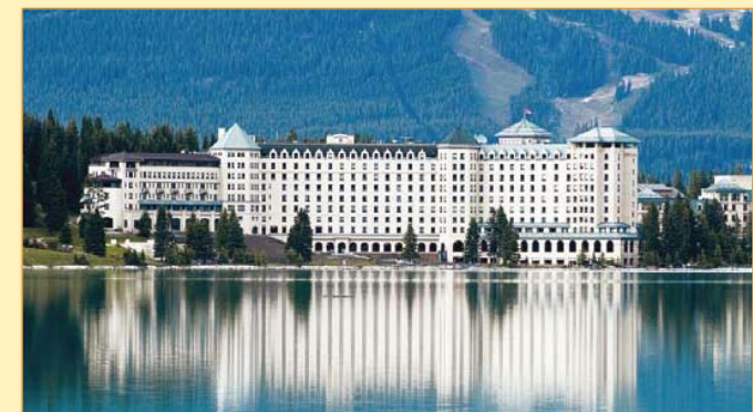
Deluxe lunch buffet at Chateau Lake Louise